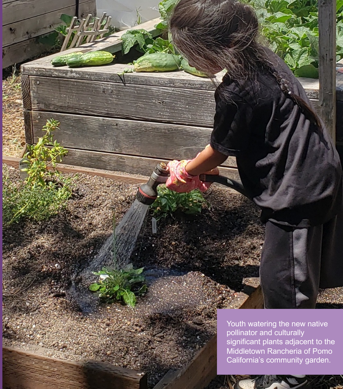
Youth watering the new native pollinator and culturally significant plants adjacent to the Middletown Rancheria of Pomo California's community garden.