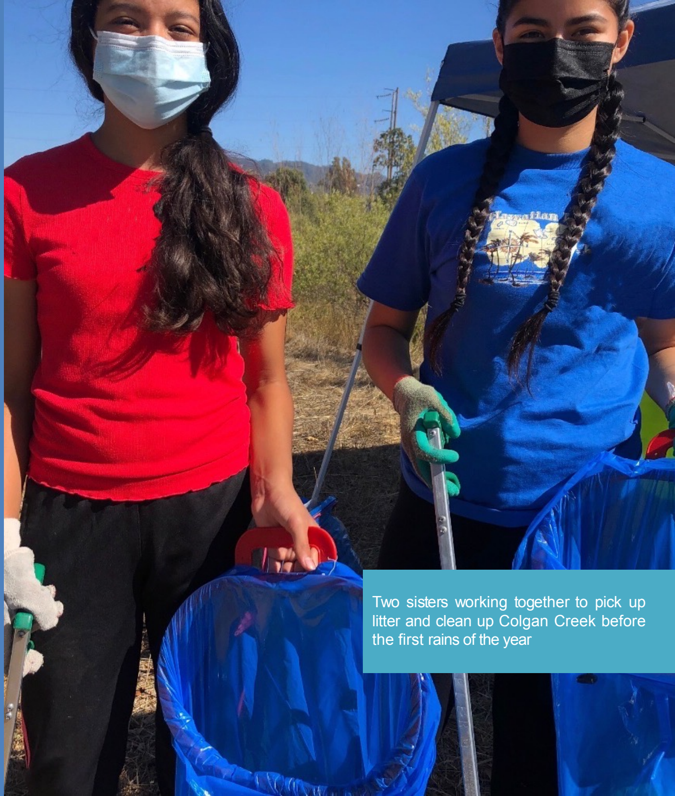
Two sisters working together to pick up litter and clean up Colgan Creek before the first rains of the year